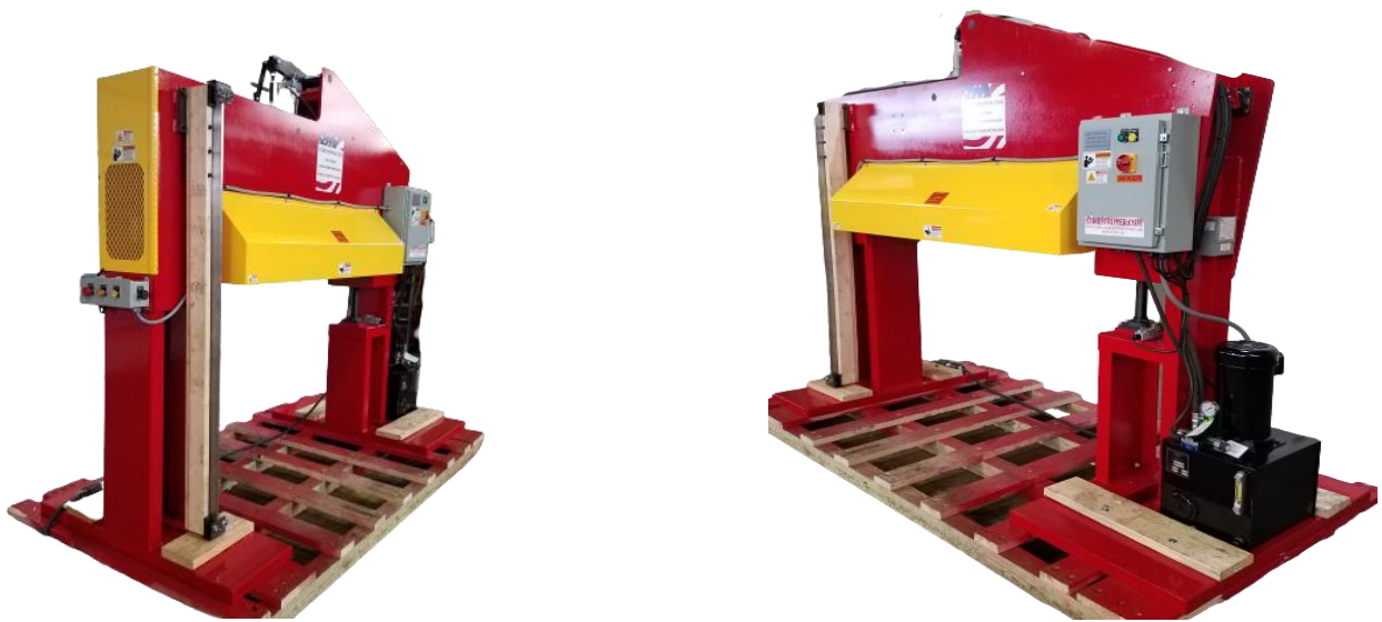
MODEL CS-66 (Shown with Optional Spare Blade and Blade Carrier)