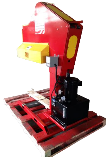
MODEL CS-32 (Shown with Optional Spare Blade)