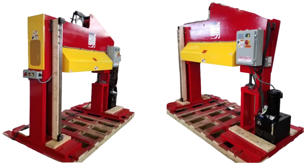
MODEL CS-66 (Shown with Optional Spare Blade and Blade Carrier)