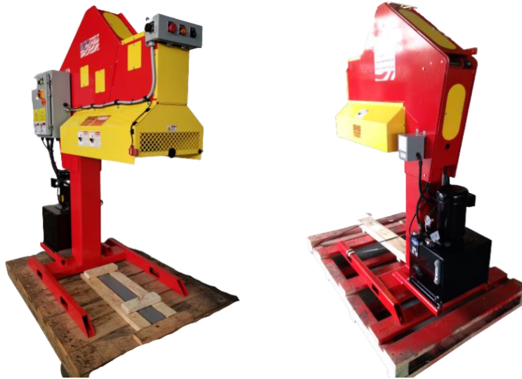
MODEL CS-32 (Shown with Optional Spare Blade)